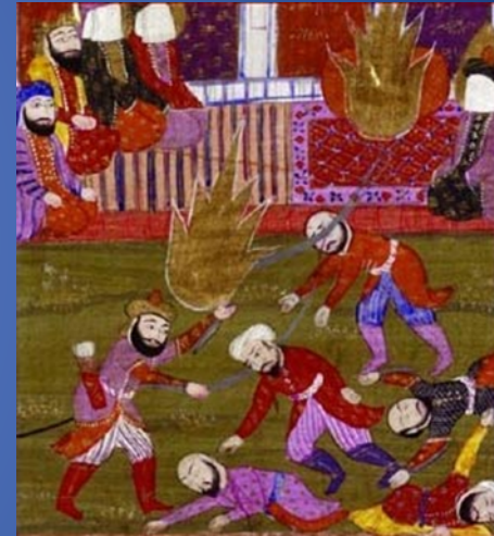
Portrait of the massacre of Jewish Banu Qurayza tribe by Muhammad in 627.

It is important to note that the Quran places great emphasis on praising those who fight, declaring them to be “one degree over” those who do not [4:95].