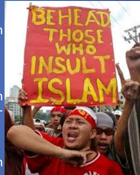
Pro-terrorist protest in Thailand.