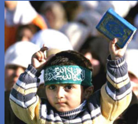
A future Hamas terrorist?

Engaging in jihad is based Muhammad’s life, sayings, and circumstances termed Deen Muhammad , or, the Way of Muhammad [Quran 3:32].