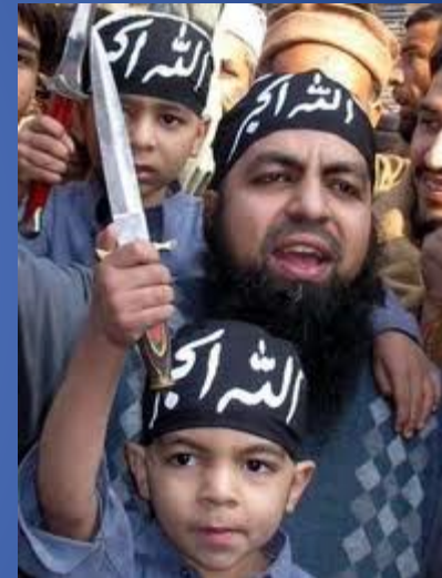
Hamas protestors in Gaza.